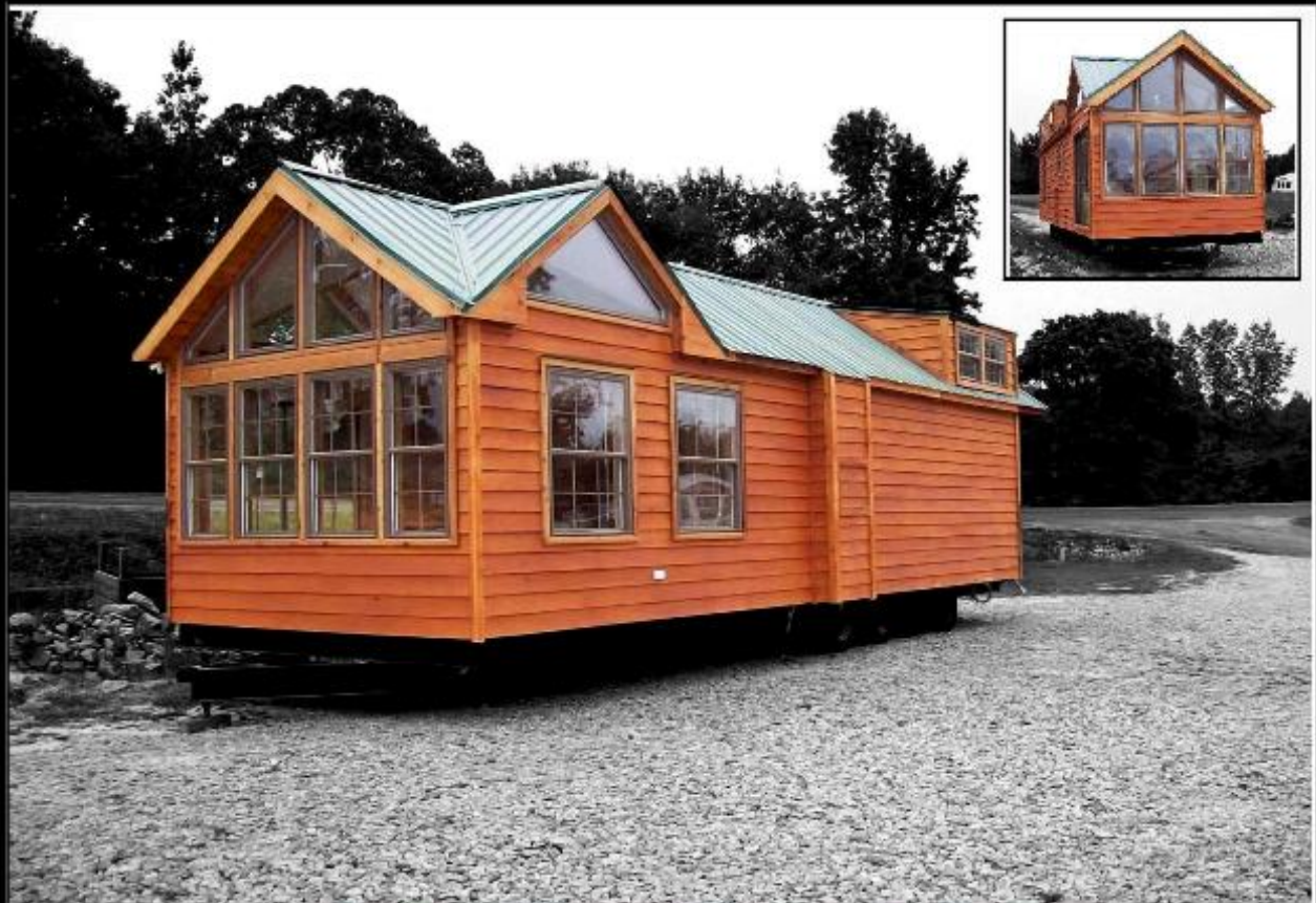
SCL-11636 STONE CANYON LODGES & PARK MODELS 12X36