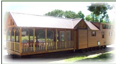
Arrowhead Cove Series