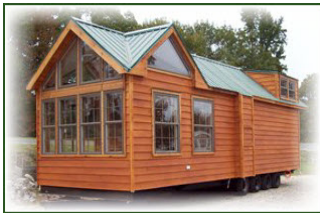
Big Bear Series